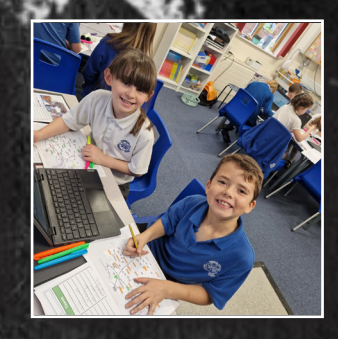
THE WEEK IN PICTURES!